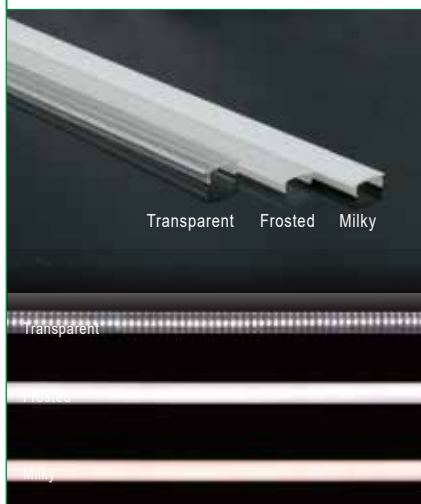
Transparent Frosted Milky